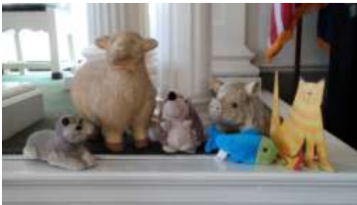
Representations of animal friends