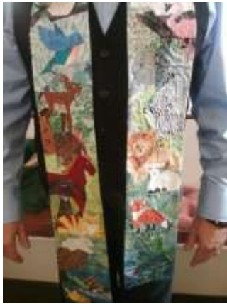
Piece work Animal Stole worn for Blessing of the Animals