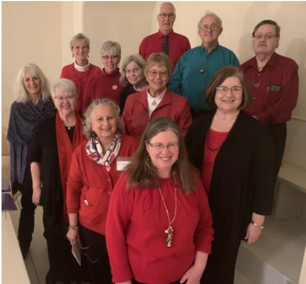
The Choir in the balcony on Christmas Eve