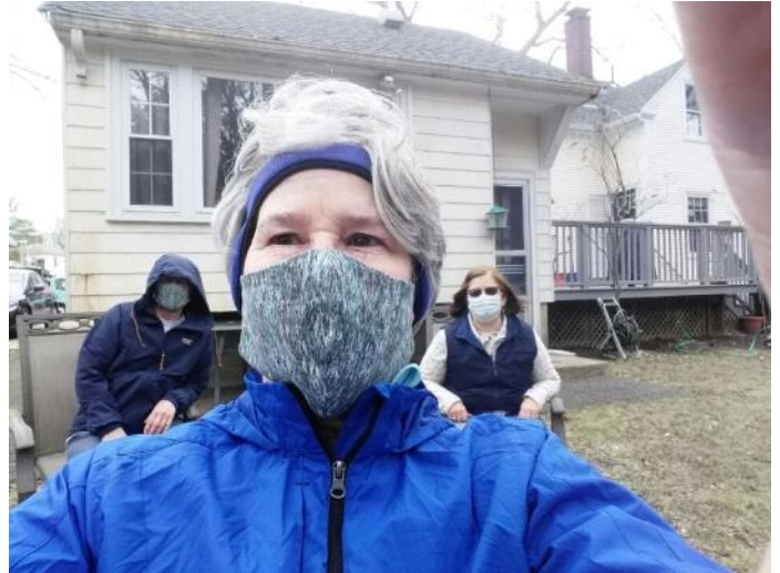
Nominating Committee Meeting in this time of social distancing.